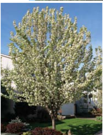
BRADFORD FLOWERING PEAR